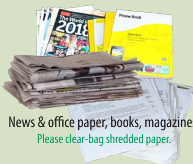
News & office paper, books, magazines. Please clear-bag shredded paper.

Fold & bundle all corrugated cardboard in 30" x 30" x 8" dimensions.