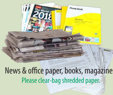
News & office paper, books, magazines. Please clear-bag shredded paper.

Fold & bundle all corrugated cardboard in 30" x 30" x 8" dimensions.