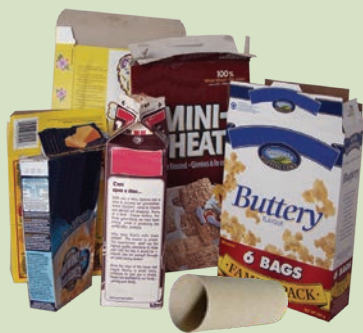
Boxboard (cereal, cracker boxes, empty toilet paper rolls etc.)

Put all of your paper products into a second blue box