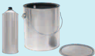
Empty and dry aerosol & metal paint cans ( leave lid off )