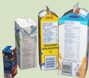
Milk/juice cartons, tetra paks, juice boxes. Please rinse. flatten and replace lids.

Liners and outer-wrap are garbage. Stuff boxes into one.