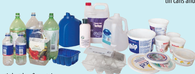
Plastic bottles, & containers Put caps back on bottles. Black plastic is garbage. Coffee pods are also garbage.