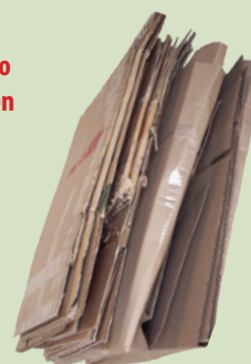
Fold & bundle corrugated cardboard in 30" x 30" x 8" dimensions, & place beside box Bundle with packing tape, or twine. Place beside Blue Box.

Stretch wrap, chip bags, wrappers, pet food bags including poly weave bags are garbage.