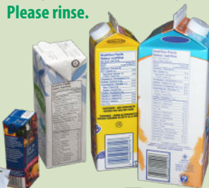
Milk/juice cartons, tetra paks, juice boxes etc. Please rinse.