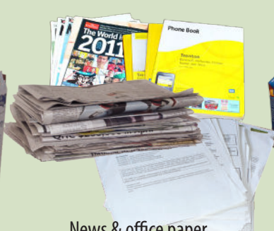
News & office paper, envelopes, books, magazines. Please bag shredded paper in a clear bag.