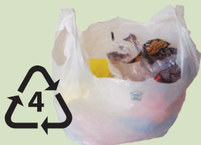
Stuff soft plastic bags inside one plastic bag, and put it on top.

Return refundable glass bottles to the beer store for a refund. Broken glass is garbage.