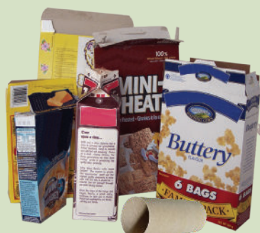
Boxboard (cereal, cracker boxes, empty toilet paper rolls etc.)

Put all of your paper products into a second blue box