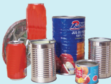
Empty & clean aluminum & tin cans and foil