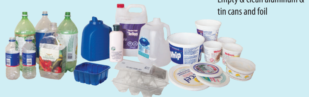
Plastic bottles, & containers Put caps back on bottles. Black plastic is garbage. Coffee pods are also garbage.