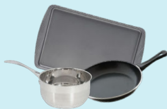
Clean used metal cookware

Put all of your plastic & metal containers into one blue box. Black Plastic is not accepted.