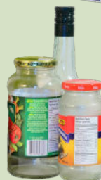
Clear and coloured glass bottles & jars on top.

Return refundable glass bottles to the beer store for a refund. Broken glass is garbage.