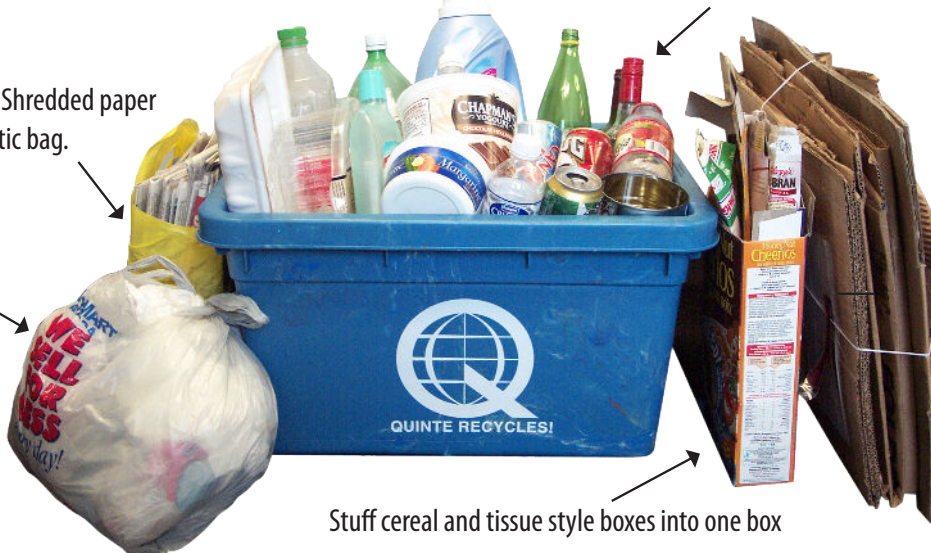
Clear and coloured glass bottles & jars on top of bluebox.

Chip bags, wrappers, and pet food bags are garbage.